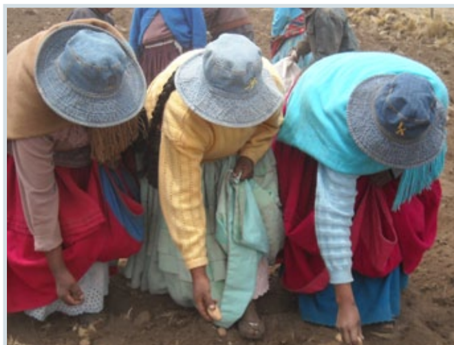
A group of women learn and implement new agriculture techniques as part of the PRAA project in Bolivia.

While farming and livestock activities remain important, mining (extraction of gold and the presence of a deposit of calcium carbonate) has recently become a complementary