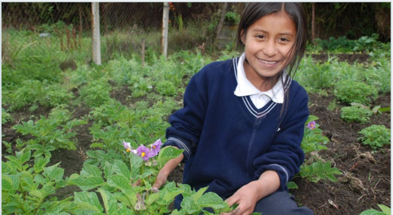
As part of the PRAA project, students aged 7-8 years old from the Quisquis school in Papallacta, Ecuador, are learning how to do maintenance on their school garden. They are weeding the lettuce, acelga and papa nabo crops. These vegetables are used to improve the nutrition of the school children by adding these vegetables to the lunches provided by the school.

It is important to validate the results obtained from the application of the tools with the communities.