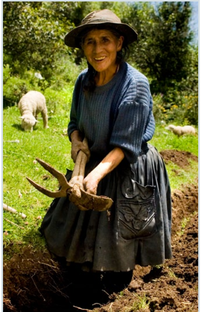
A woman in Shullcas, Peru, digs a canal to capture water from rain and glacial melt for irrigation purposes as part of CARE Peru's PRAA project.

One CVCA instrument that enabled the identification of at-risk groups was the Community Mapping tool. This tool has among its objectives to identify the location of vulnerable zones and/or the most vulnerable social groups. In Peru, for example, the most vulnerable groups identified were women responsible for families and older adults responsible for families (as they often have lower mobility). In Bolivia, it was observed that in places where most men do non-agricultural work – such as mining, for example, the women take responsibility for agricultural activities and caring for their families. This makes them more vulnerable to any negative impact on crop production. It was also women who most vocally expressed their concern for water quality, and threats to crops and health. Younger children were also mentioned as being vulnerable, because they are more likely to suffer from respiratory illness from low temperatures.