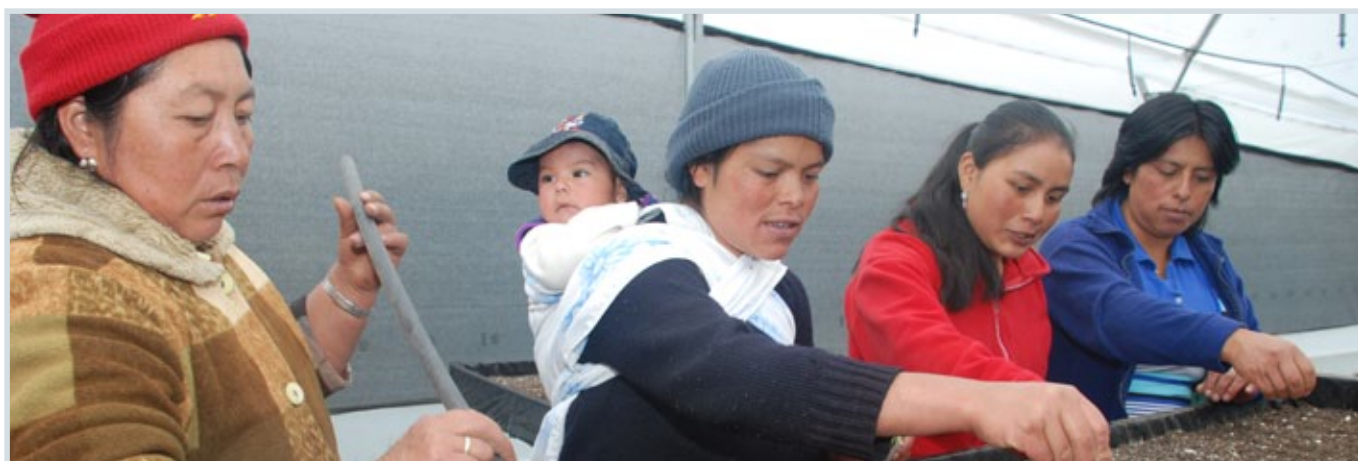
Through the PRAA project in Ecuador, groups of women aged 19 to 70, belonging to the Valle del Tambo community, gain knowledge and skills. They work in a local green house for planting vegetables like lettuce, cauliflower, carrots, and beets. The farmers are mothers who did not previously have vegetable gardens.

Public investment in education and health is limited;