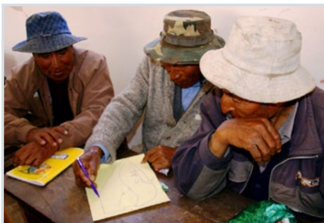
Local residents from Tapacaya, Bolivia, work together on CARE’s Climate Vulnerability Capacity Analysis (CVCA).