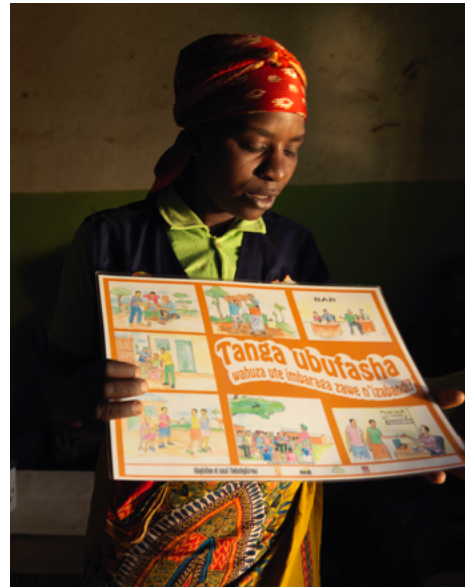
CA with an Indashyikirwa poster.

Several staff and CAs interviewed emphasized that the participatory, benefits-based approach was highly motivating for community members' engagement.