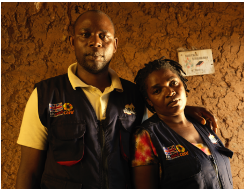
Community activist couple.

By the endline interviews with CAs however, this appeared to have shifted with CAs offering more spontaneous and informal forms of activism. The majority of CAs responded to regular requests to support individuals privately (i.e. home visits).