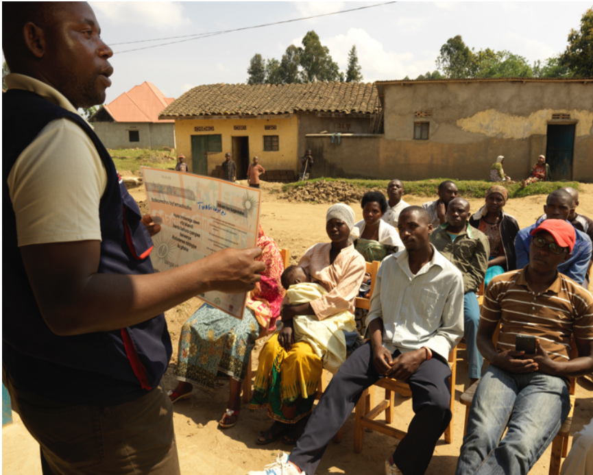
Description: An Indashyikirwa CA facilitating activism

C ommunity activism is increasingly being used as a strategy to shift harmful social norms, and ensure an enabling environment for preventing and responding to gender based violence. The Indashyikirwa programme in Rwanda equipped trained couples as community activists. This practice brief highlights the lessons learned from engaging couples as community activists as part of an IPV prevention programme.