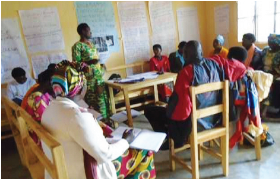
A group discussion as part of the couples' curriculum.

I ntimate partner violence (IPV) is the most common form of violence against women, with an estimated one in three women having experienced partner physical or sexual violence in their lifetime. 1 The Indashyikirwa programme in Rwanda is an intervention that aims to prevent IPV and support healthy, equitable relationships through a participatory couples curriculum and community activism activities. The programme has been rigorously evaluated through research conducted with couples in the intervention. This practice brief highlights lessons learned from working and conducting research with couples to prevent IPV.