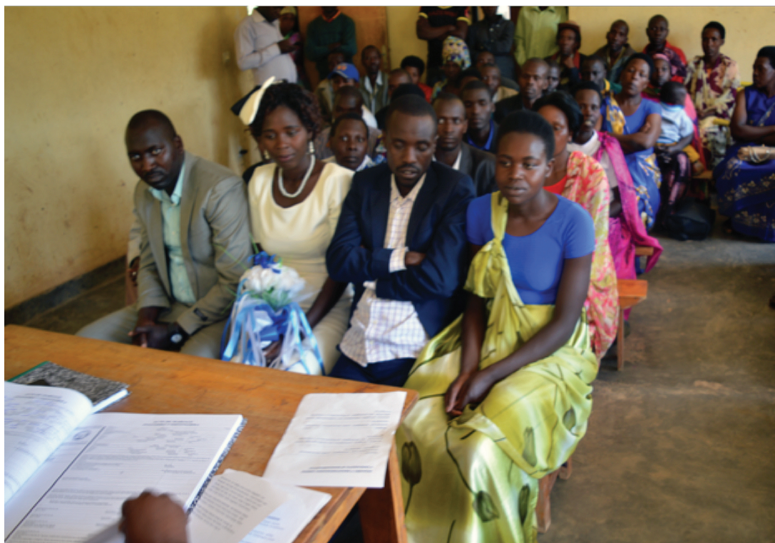
A sub-set of some of the trained couples who as a collective group legalized their marriages after the curriculum.

RWAMREC staff continued to meet with the trained couples for the duration of the programme, to support their relationships and community responses, including referral processes.